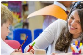
Wrap Around Care (Breakfast and After School Clubs)