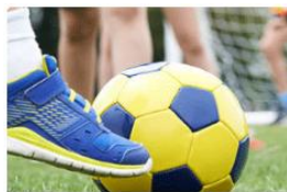
Clubs and Activities (including Sports Academies)